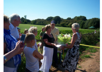
Chair of Whetstone Allotment Association officially opens the Allotments

Work continues on the site to ensure that it is maintained to a high standard, with fencing being renewed using old pallets and a green wildflower /Community area being developed.