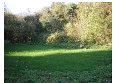
Green Wildflower/Community area

The Allotment Association wishes to thank and acknowledge the assistance and advice afforded to them by Whetstone Parish Council in preparing the site and its maintenance.