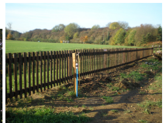
Fencing around the perimeters has been renewed using old pallets