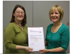
Badgerbrook with their certificate

This celebration of the best in international activity was attended by representatives from schools across the UK. Badgerbrook and St Peter's have received this award for their outstanding work in bringing the wider world into the classroom through a range of international projects.