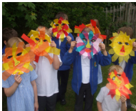
Children from St. Peter's with their Mexican masks

For St Peter's and Badgerbrook international work began with the decision to twin with 2 schools near Madrid in Spain. The Spanish teachers visited our schools and agreed areas of joint working aimed at improving children's knowledge of each others' countries and cultures. E mail contacts were of course an important aspect of this not to mention the beginning of Spanish lessons. Large parcels of work were sent and received, especially at Christmas. The following summer the British Council funded a week's visit by a teacher to the Spanish school to work more closely with the Spanish teachers and their children.