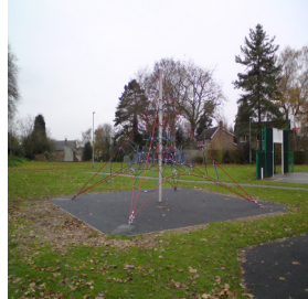
The two new pieces of play equipment, Space Net on the left and Climbing Wall on the right, installed on Trinity Park in the last few weeks.