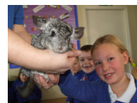
Admiring the chinchilla